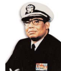
Vice Admiral Samuel L. Gravely

Prior to World War II, laws prohibited African Americans from serving as officers in the United States Navy. It was the combined pressures of World War II--with its growing requirement for talented manpower--and the efforts of many civil rights organizations that finally convinced President Franklin Roosevelt to establish a new policy to enable African Americans to earn a commission in the Armed Forces. In the spring of 1944, thirteen African Americans were commissioned as naval officers and soon became known as "The Golden 13" because of the gold Ensign stripe they wore so proudly on their uniforms. In 1976, Samuel L. Gravely, was selected for promotion to the rank of Vice Admiral. Since then, a small but distinguished group of African American officers are following in his footsteps.